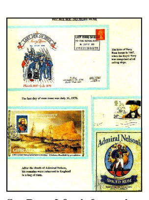
See Page 2 for information