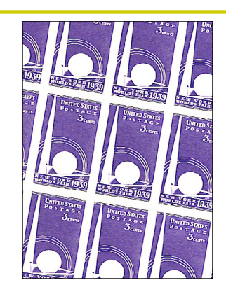
NY World's Fair; See pg.-3

Closing: $4,579.68 (28 Feb) 3-CDs valued at $6,862.36