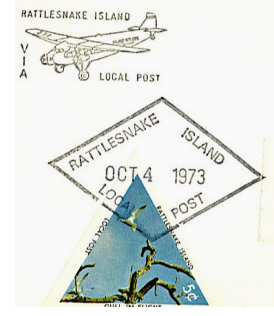
Signature triangular stamp, R.I. cancel, & rubber stamped etiquette from a R.I. post card

Bill would like to meet you for dinner at The Olive Garden if you can make it at 4:15 PM. Contact P. Petersen to sign up.