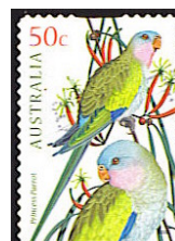
Selected Stamps of Australia. For More, See Page-4.