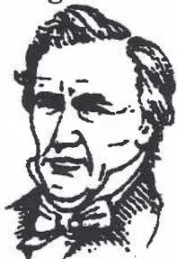
James Buchanan 15th President of the United States 1857-1861

Lancopex '07 commemorates 150th Anniversary Inauguration of