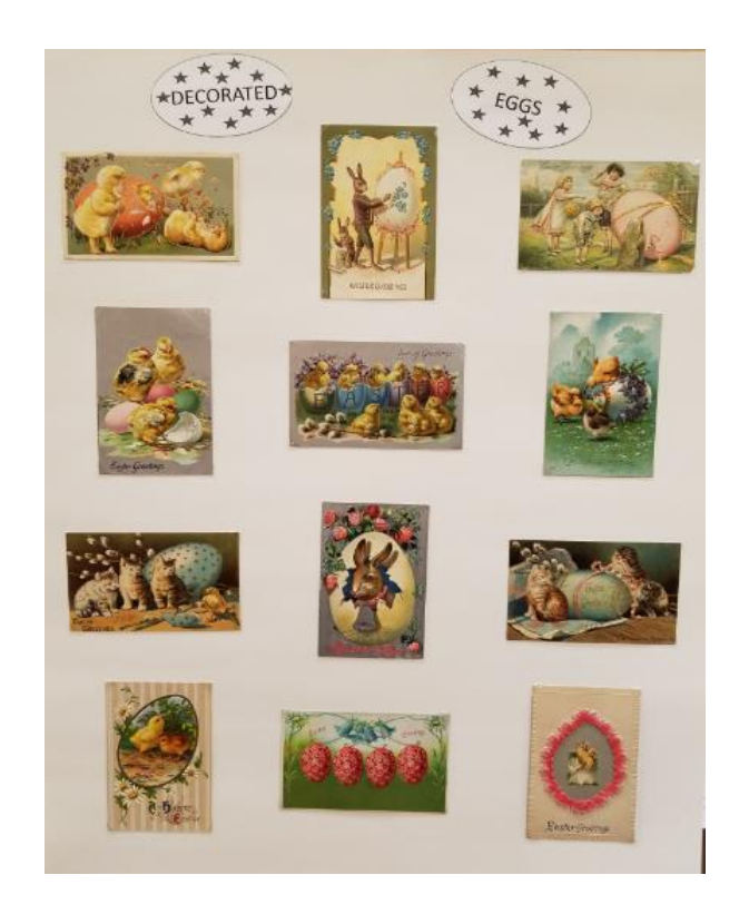
1st Place - Susan Glass