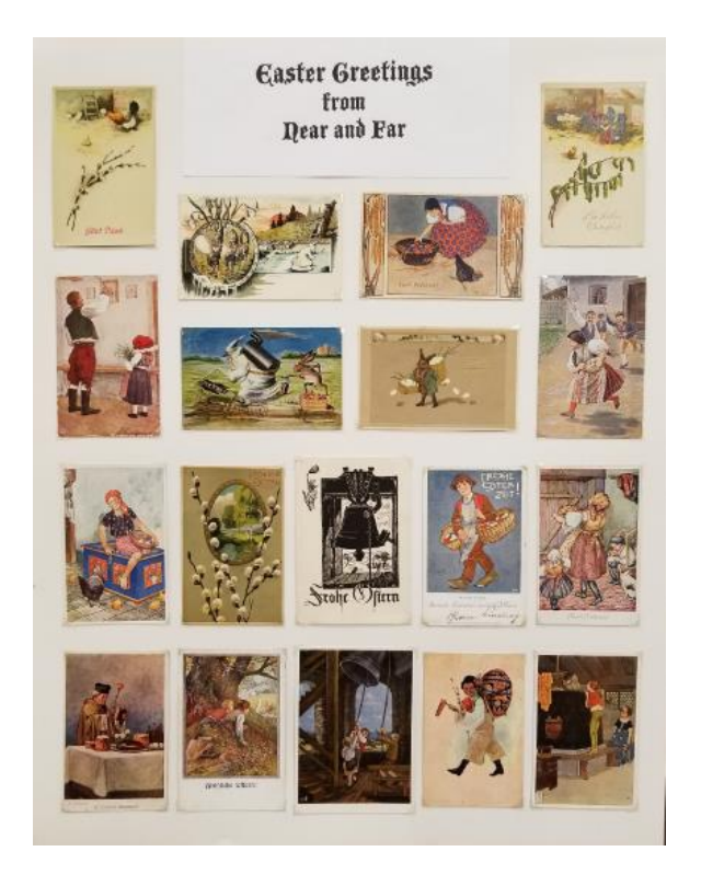
2<sup>nd</sup> Place - Gisela Withers