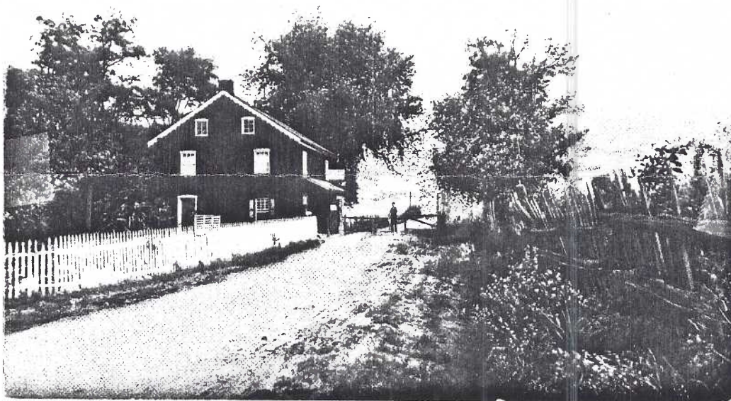
Horseshoe Pike Toll Gate, Lancaster, Pa.