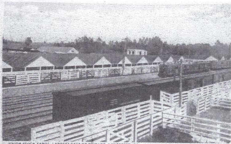
UNION STOCK YARDS, LARGEST EAST OF CHICAGO, LANCASTER, PA. CAPTION FROM AMISH STOCK YARDS, LANCASTER, PA.