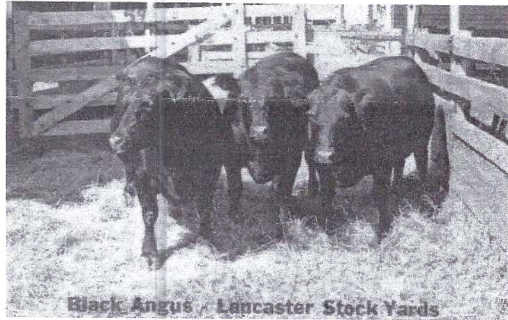
Black Angus / Lancaster Stock Yards