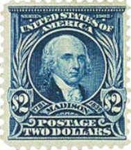
Tonight: History and Stories of the 1902 Series