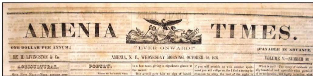
Figure 5. Masthead of the Amenia Times , Vol. V, No. 30, October 22, 1856.