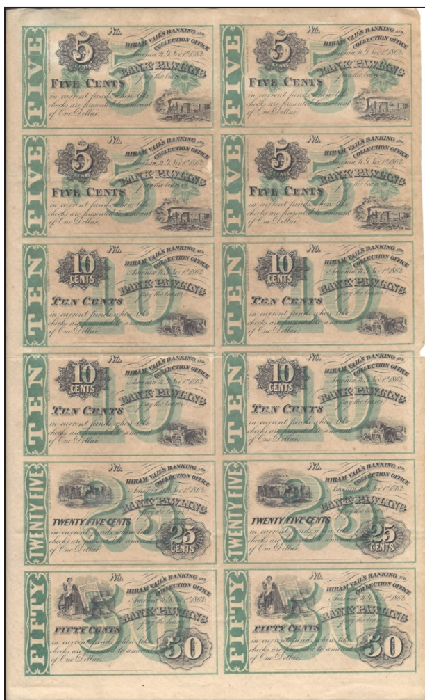
Figure 8. Uncut Sheet of Hiram Vail's Banking and Collection Office Notes, Amenia, N.Y. Nov. 1 st , 1862.

Amenia. Hiram Vail's Bkg and Collection Office (on Bank of Pawling). 1862. Nov. 1.: 5¢ Train r.; 5¢ Female and shield. (wrong, see 50¢); 10¢ Horses r.; 25¢ Cattle l.; 50¢ Train r. (wrong listing, it is Female & Shield l.)