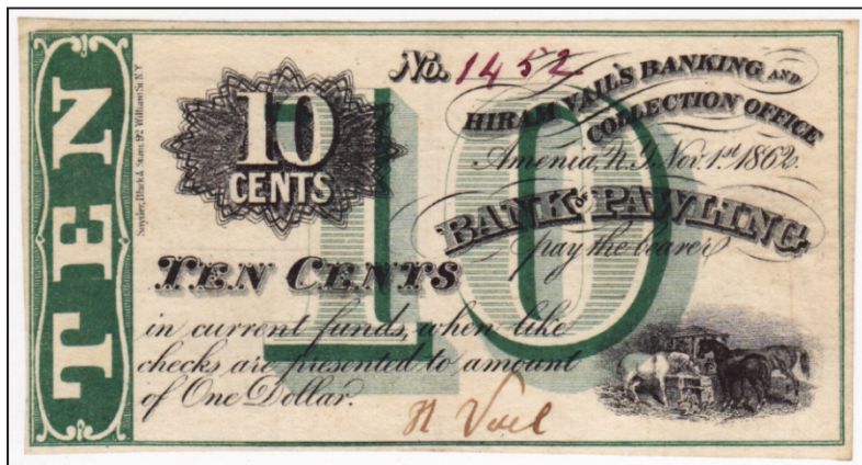
Figure 7. 10 Cents Note (98 x 54 mm design), Hiram Vail's Banking and Collection Office, Amenia, N.Y., Nov. 1 st , 1862, No. "1452" in magenta ink, signed "H Vail".

This October 1862-dated note is not listed in the 1894 illustrated 4 th edition of the Standard Paper Money Catalog (Scott Stamp & Coin Co, New York, NY), suggesting it might not yet have been discovered. What are listed in the 1894 4 th edition are the 10¢ note in Figure 7 and the impressive uncut sheet in Figure 8 .