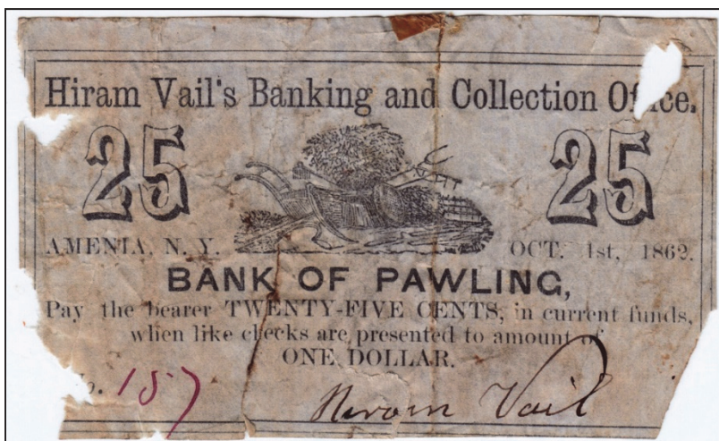
Figure 6. 25 Cents Note (85 x 48 mm design), Hiram Vail’s Banking and Collection Office, Amenia, N.Y., OCT. 1 st , 1862, No. “157” in magenta ink, signed “Hiram Vail”.

Pawling, ~22 miles south of Amenia along Route 22, which served as a drover’s road since before the American Revolution, has a rich history from the early 18 th century when Quaker settlers purchased the land known as “The Oblong” to the Army Air Corp Convalescent hospital created from the Pawling School and Green Mountain Lakes Camp during World War II. From an online search of the Heritage Auctions archive ( www.ha.com ), I have located 5¢ and 10¢ notes from this series with the analogous central design.