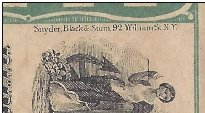
Figure 9. Lithographer and Publishing Firm “Snyder, Black and Sturn, 92 William St. N.Y.” notation on Hiram Vail's Banking and Collection Office Note, Amenia, N.Y. Nov. 1 st , 1862.

Hiram Vail had sheets of 12 printed for his November 1862-dated Banking and Collection Office notes in four denominations (5¢, 10¢, 25¢ and 50¢), with four different scenes (a Train, Horses, Cattle, and a Female with Shield, respectively); where the 5¢ and 10¢ were in quadruple per sheet and the 25¢ and 50¢ were in duplicate. He utilized the well-known lithographers and publishing firm of Snyder, Black and Sturn, located at 92 William Street in NYC ( Figure 9 ). These notes are an evolution in quality and design from his earlier 5¢, 10¢, and 25¢ notes.