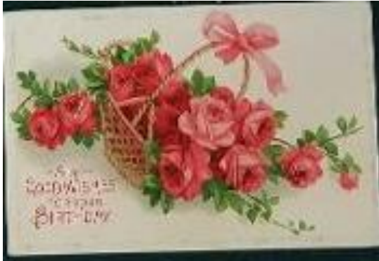
POSTCARD to CAKE