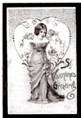
Valentine postcard, circa 1900-1910