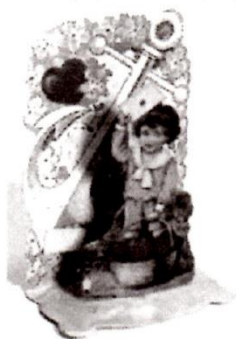
A tiny 2" pop-up Valentine, circa 1920