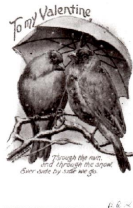
"Through the rain, and through the snow, ever side by side we go" – sent 1907