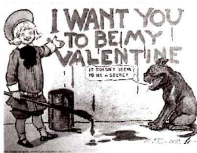
Buster Brown Valentine postcard by Richard Felton Outcault, early 20 th century