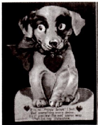
A grommet affixed to the center of the card permits the dog's eyes to glance side-to-side when the blue bow is moved