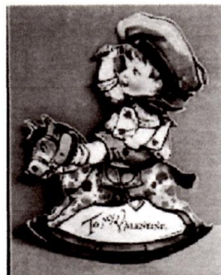
Rocking horse and rider, circa 1920-1930