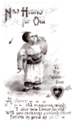
Postcard by Nister, circa 1906