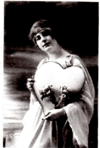
Valentine's Day postcard, circa 1910