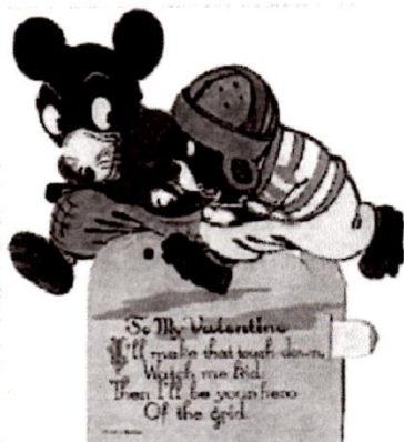
Football-playing anthropomorphic rat and bulldog are set in motion by the pull-tab on the right, circa 1920