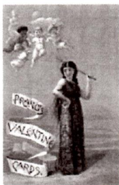
Advertisement for Prang's greeting cards, 1883