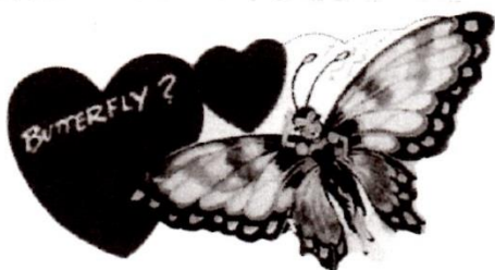
Children's Valentine, 1940-1950