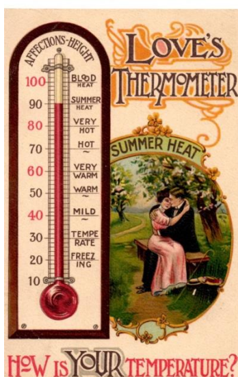
B.B. London Series, No. E33, Printed in Germany