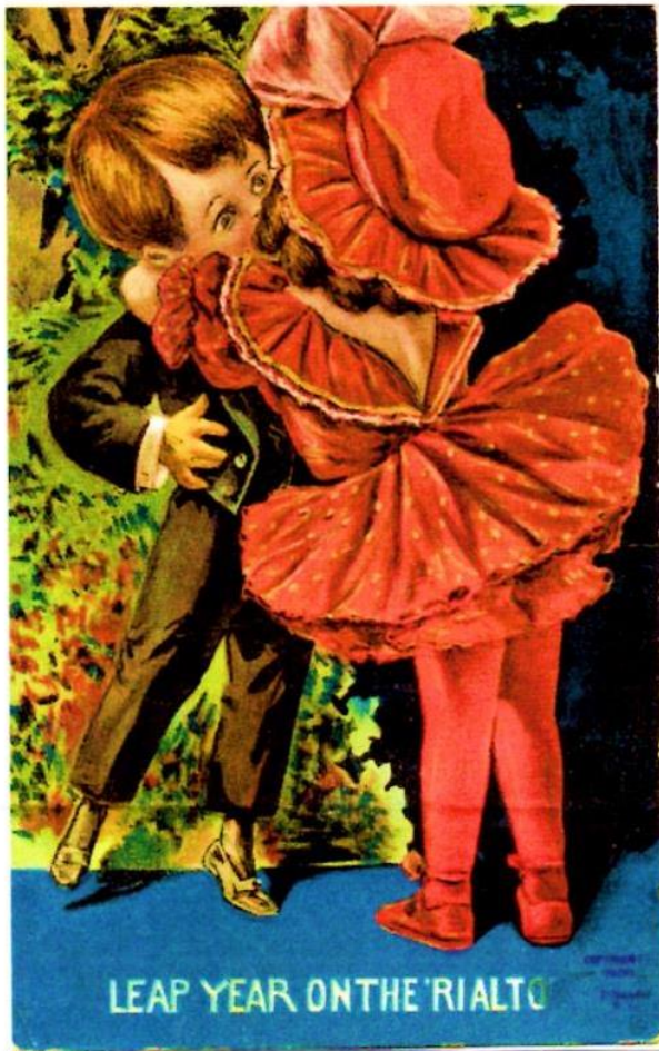
On the Rialto (stage)