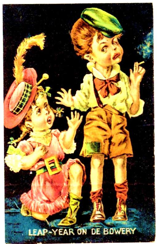
On De Bowery (NYC)

With equality of the sexes, these cute kids are but a memory.