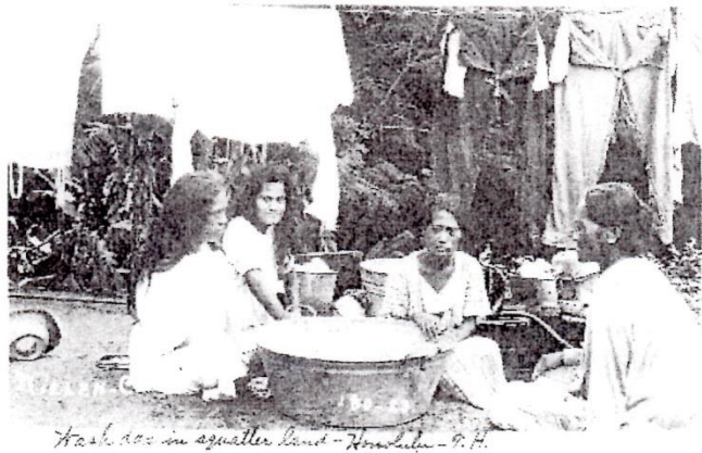
Wash day in squatter land - Honolulu - P. H.