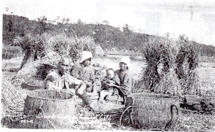
"Lunch Time in Harvest Field, Odawara, Japan" – Obviously, his desire to capture the culture of the people extended to his world travels as well.

Wise men are instructed by "Reason"; Men of less understanding by "Experience"; The most ignorant learn by "Necessity"