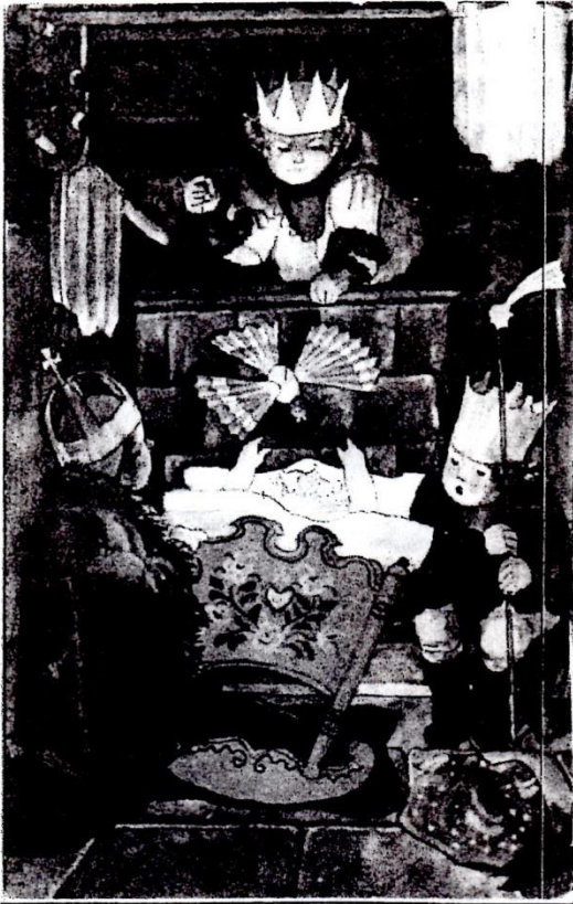
Star Boys can still be found actively playing their roles in many Central European countries and parts of Scandinavia.