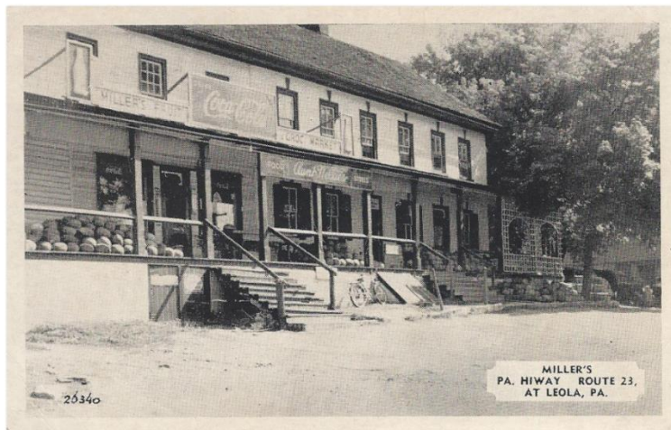
Dexter Press Silvercraft postcard published in the early 1940's. Reverse is labeled "Miller's Fruit & Grocery Market – Fountain Service – "Where Prices are Always Lower – Leola, Pa."