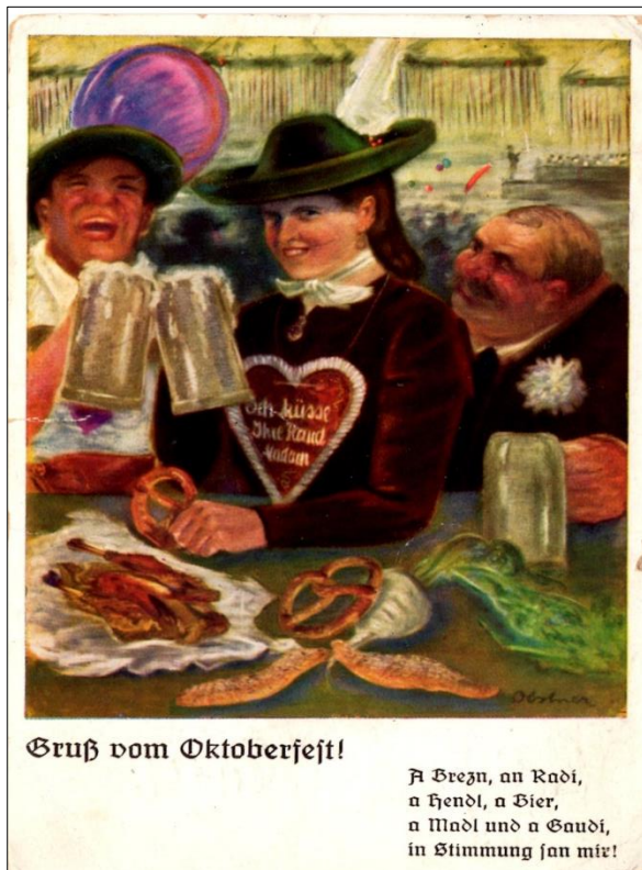
Food & drink – roast chicken, pretzels, radish, gingerbread hearts & beer