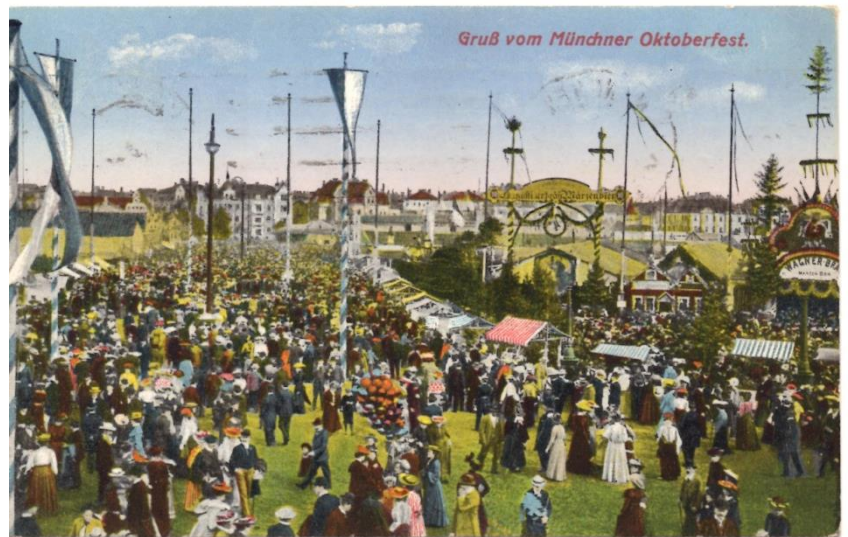
Crowded amusement area