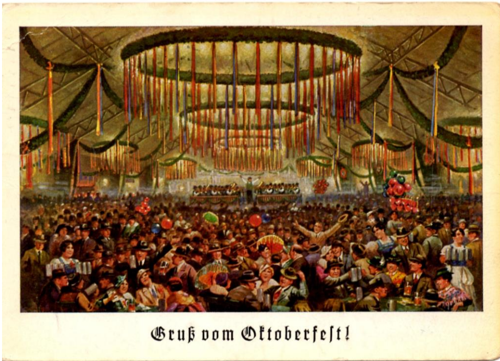
Interior of tent run by breweries