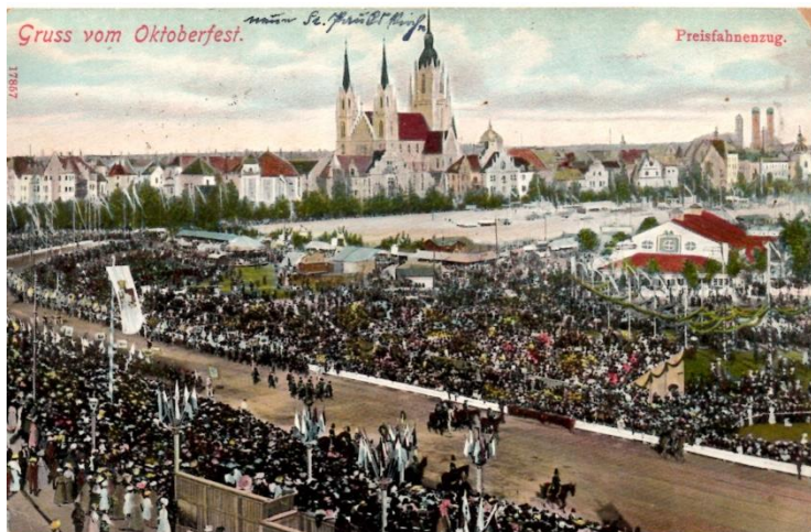
Parade of Costumes

On the first day the Mayor of Munich will tap the first barrel of beer. The tents open at noon and close at 10:30 pm. The next day there is a Costume and Marksmen parade. There will also be a band of 400 musicians giving an open air concert. They also will have sold 500 thousand roast chickens, 55 thousand pigs knuckles and more then 100 oxen were eaten. Every year the Oktoberfest gets bigger but not this year. The Oktoberfest has been cancelled.