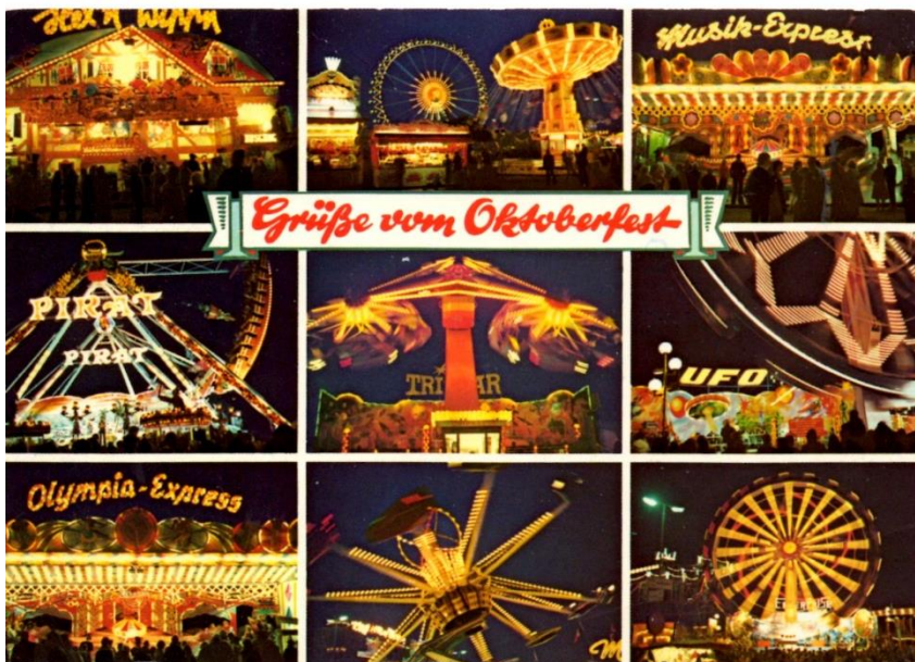
All kinds of rides