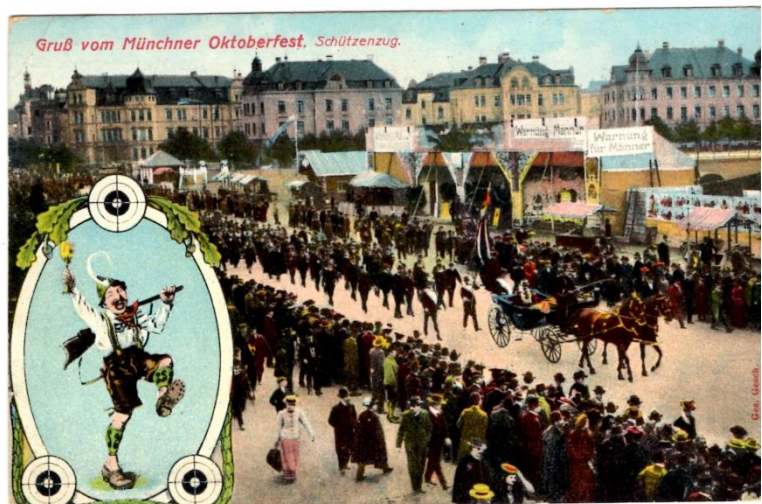
Parade of Marksmen