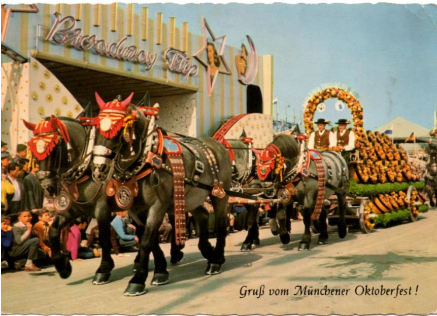
Parade of Breweries